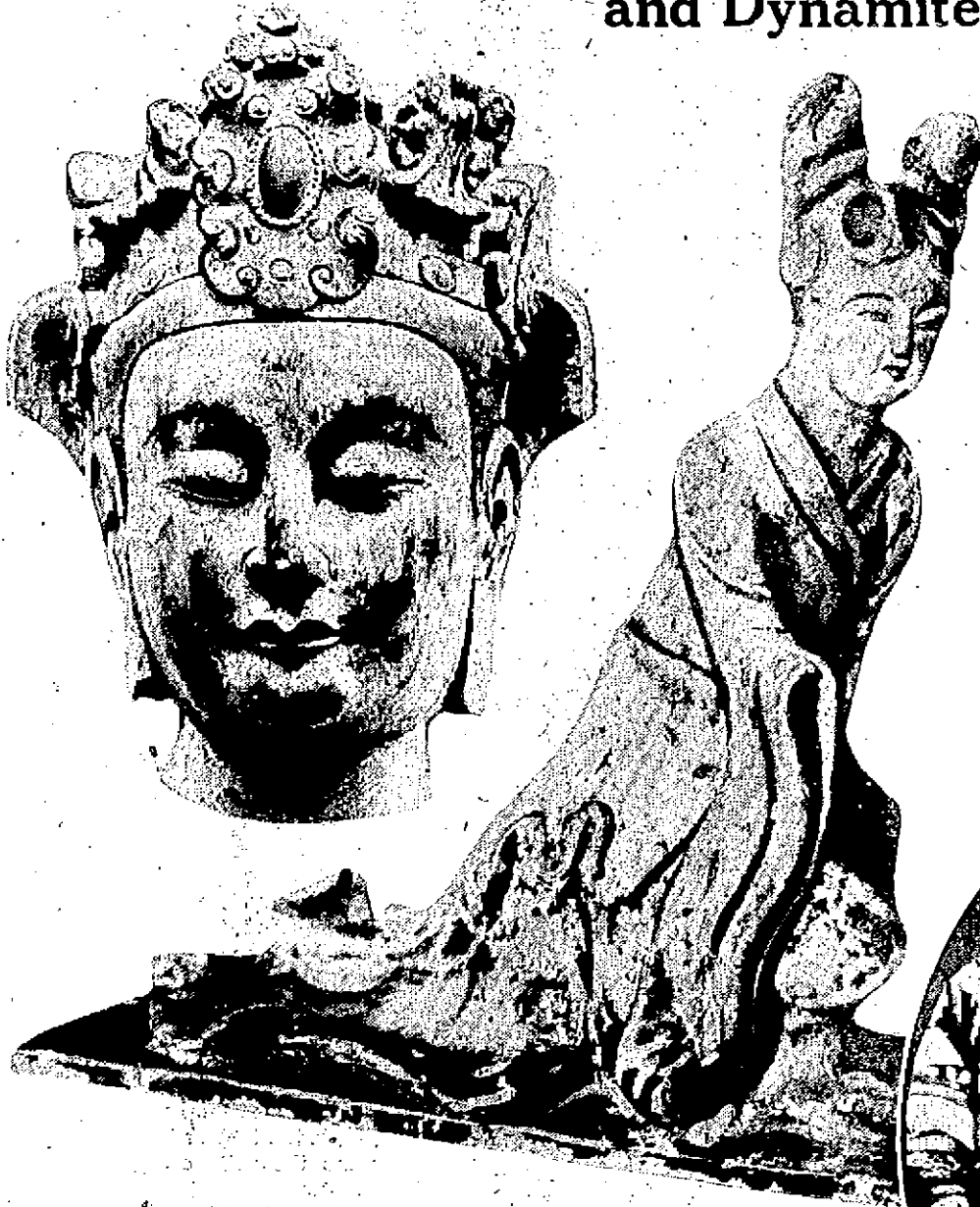
A Remarkable Ancient Chinese Bust and Terra-Cotta Figure, of Which Even More Exquisite Examples Were in the Tombs of the Dowager Empress and Were Destroyed by Looting Soldiers.

Her Magnificent Tomb and Those of 36 Empresses Broken Into, Burned and Dynamited, Priceless Treasures Stolen and Her Sacred Corpse Kicked Around and Desecrated