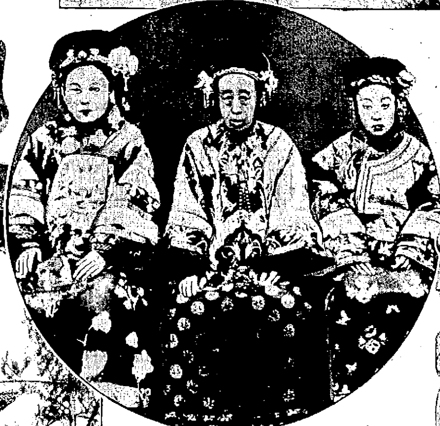
A Rare Photograph of the Old Empress Dowager, With Two of Her Pretty Ladies-in-Waiting.

and the pillage was carried out on a great scale by men having the equipment of modern armies. The Empress's tomb was nearly blown to pieces by high explosives to find the chamber containing the jewels.