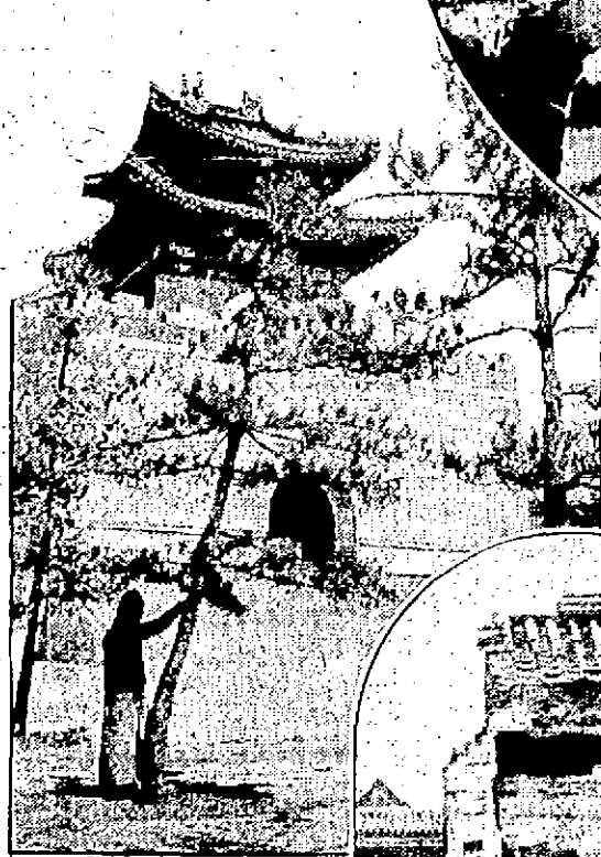
The Beautiful Tomb of the Dowager Empress Tze-Shi, as It Was Before the Destruction, and Beside It One of Its Dynamited Sections.

They said that not only were the imperial tombs looted, but the remains